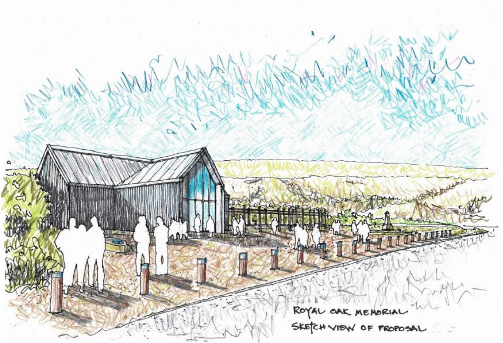
ROYAL OAK MEMORIAL SKETCH VIEW OF PROPOSAL