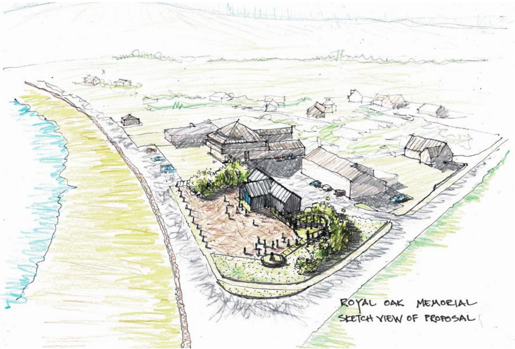
Sketch of Proposed Site Layout – HMS Royal Oak and Scapa Flow Memorial Building