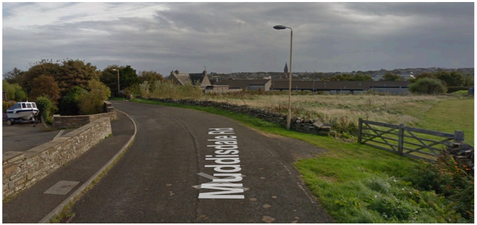
MUDDISDALE ROAD - LAST STREETLIGHTING COLUMN