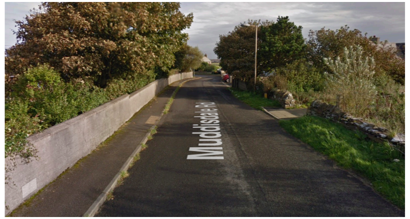
MUDDISDALE ROAD - CROSSING POINT