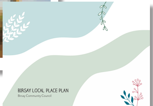
BIRSAY LOCAL PLACE PLAN Birsay Community Council