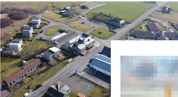
DOUNBY COMMUNITY PLAN Local Place Plan

As of February 2026 there has been three Local Place Plans registered and we are aware of several others about to be submitted for registration