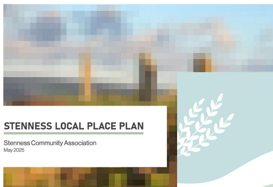
STENNESS LOCAL PLACE PLAN