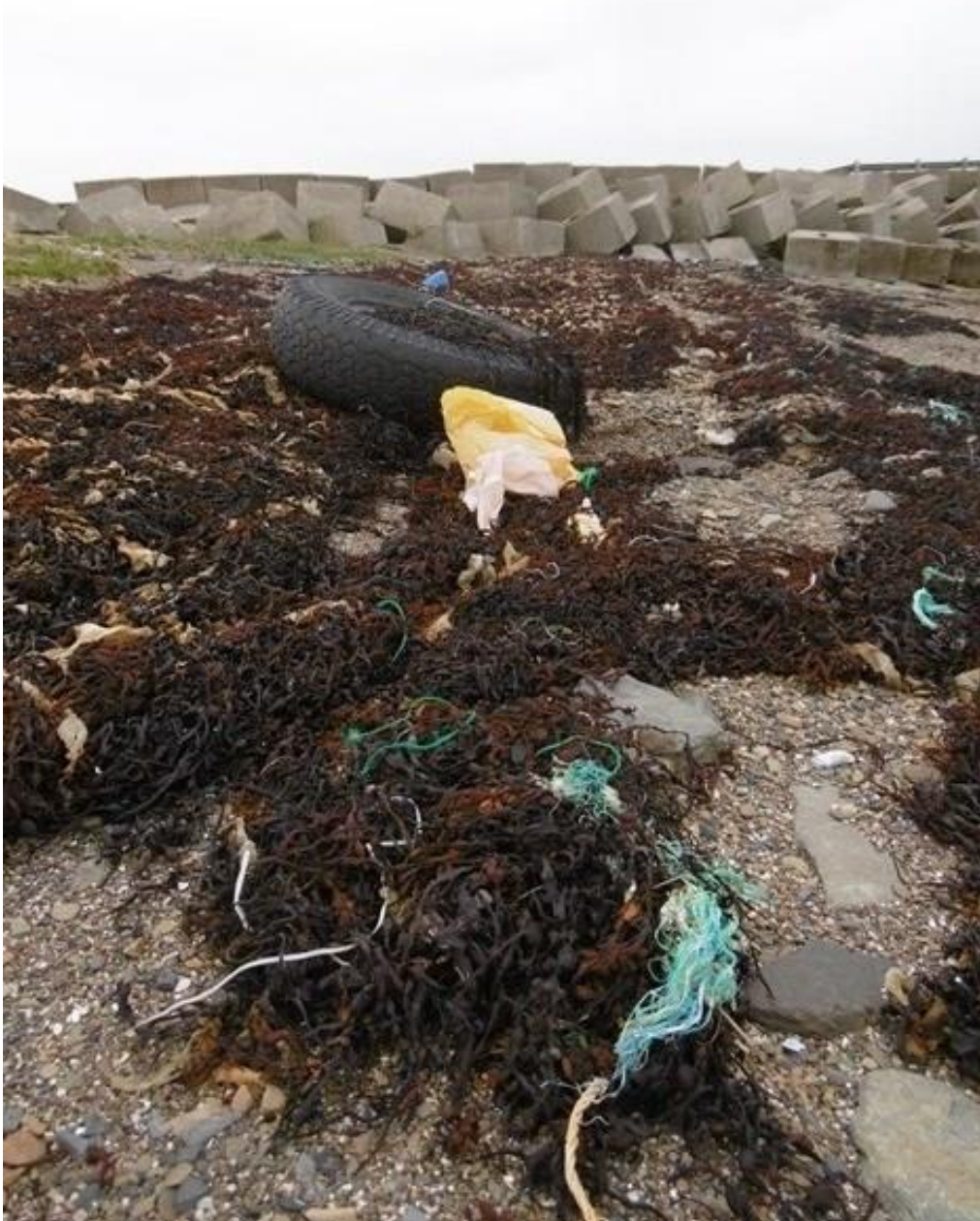
Marine Litter at No. 1 barrier

Plastic waste accounts for a large percentage of marine litter and causes harm to marine life in several ways. It can cause entanglement and drowning, or animals may eat it mistaking it for their usual prey species. Puffins, Fratercula arctica , have been recorded feeding plastic to their chicks.