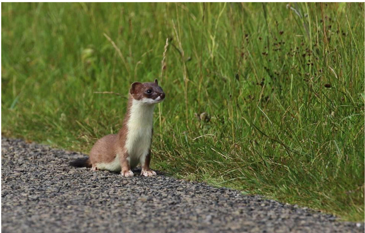
A Stoat in Orkney

In 2014 Scottish Natural Heritage (SNH) commissioned a report 4 , to consider the possible effects of the stoat population on Orkney's native species. The report recommended that removal of the stoat population is the best option to safeguard Orkney's wildlife. As a result, the Orkney Native Wildlife Project (ONWP) has been established, led in partnership by SNH and the Royal Society for the Protection of Birds Scotland (RSPB), and with the generous support of the National Lottery through the Heritage Lottery Fund. In 2017 Orkney Islands Council (OIC) agreed to be a non-financially contributing partner.