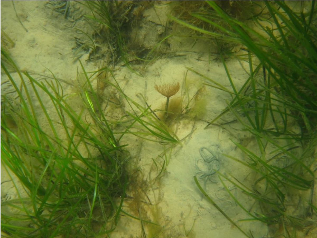
Widewall Seagrass with Peacock worm and Lugworm casts

Seagrasses, Zostera spp. are marine flowering plants but they are not actually grasses. They are found in shallow coastal areas around the world, in areas that are afforded at least some shelter from wave action, for example sea lochs, inlets, bays, sounds and lagoons. They occur on sands, mud and gravel, on the lower shore and subtidally, down to 10m in a range of tidal conditions and in full or variable salinity.