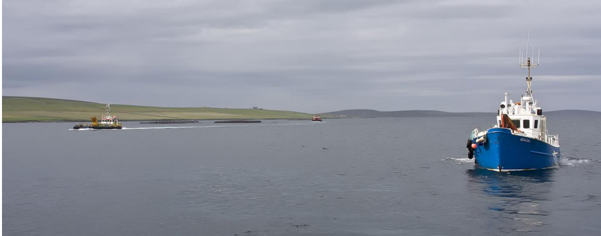
Fish Farm and other Marine activity

Increasing numbers of people work in Orkney's marine environment, e.g. in the inshore fishing, aquaculture and marine renewables industries, and they are well placed to record sightings of marine species and their behavioural traits.