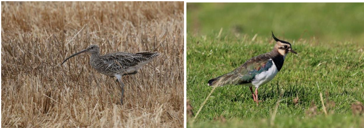
Curlew and Lapwing

Livestock rearing is the main form of farming activity in Orkney, along with cultivation of arable crops such as barley, bere and oats. Swedes are also grown, mainly for animal fodder, as well as potatoes and other vegetables for human consumption. This mixed style of farming provides rich breeding and feeding areas for a wide range of bird species and Orkney is a particularly important stronghold for waders such as curlew, Numenius arquata , lapwing, Vanellus vanellus , redshank, Tringa totanus and oystercatcher, Haematopus ostralegus .