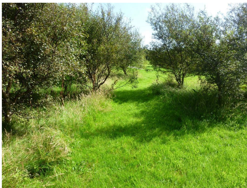
Trees at Muddiesdale, Kirkwall

Towns and smaller settlements include public 'parkland' and grassed areas that are managed and maintained by Orkney Islands Council (OIC). These areas have largely been designed and maintained without thought as to how they could contribute to biodiversity objectives.