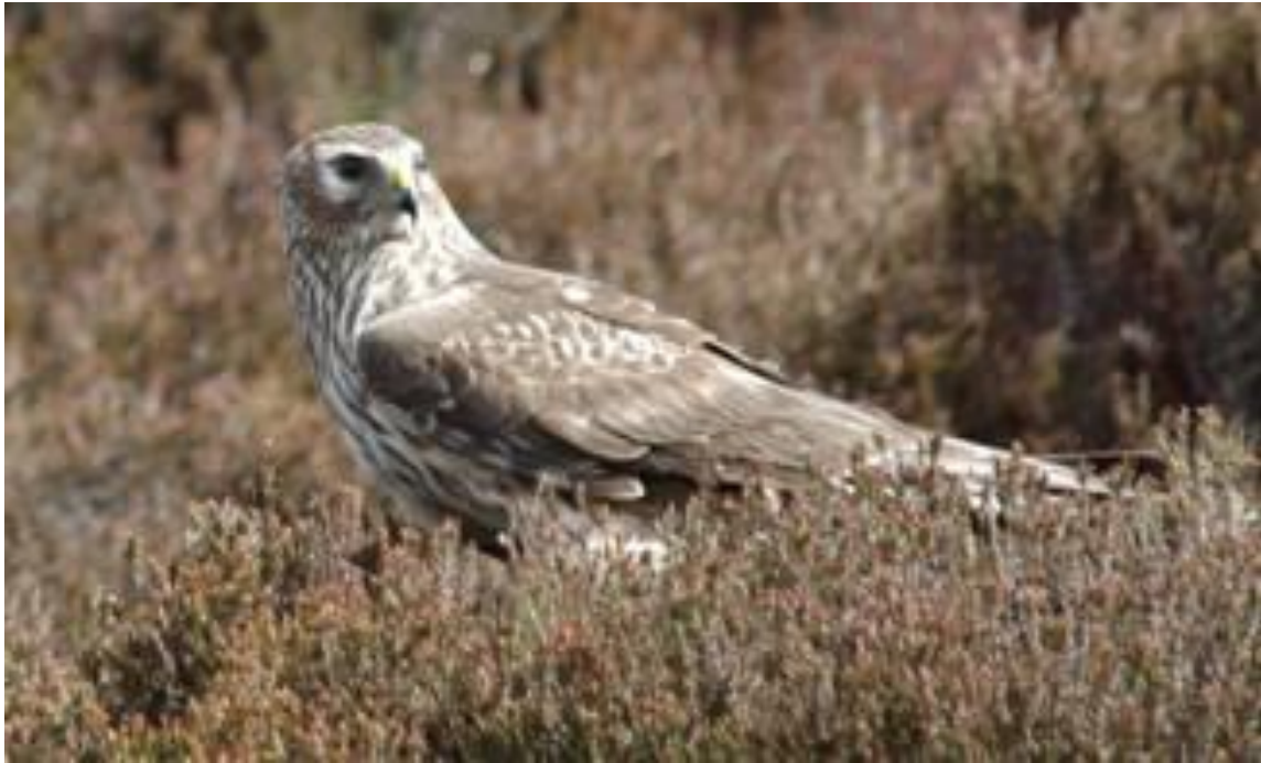
Female Hen Harrier

Orkney is a vital stronghold for Hen harrier, with an estimated 83 breeding pairs in 2016. While Hen harriers are declining in other parts of the UK, the Orkney population is remaining stable.