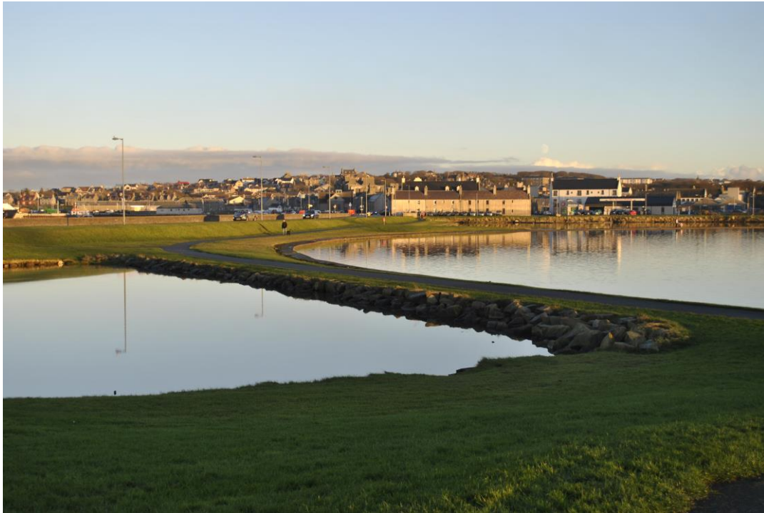
The Peedie Sea, Kirkwall

Further information on this habitat and the species it supports is included in the Built-up areas and gardens Habitat Action Plan (HAP) in the original Orkney LBAP (2002) which is available on the Council's website.