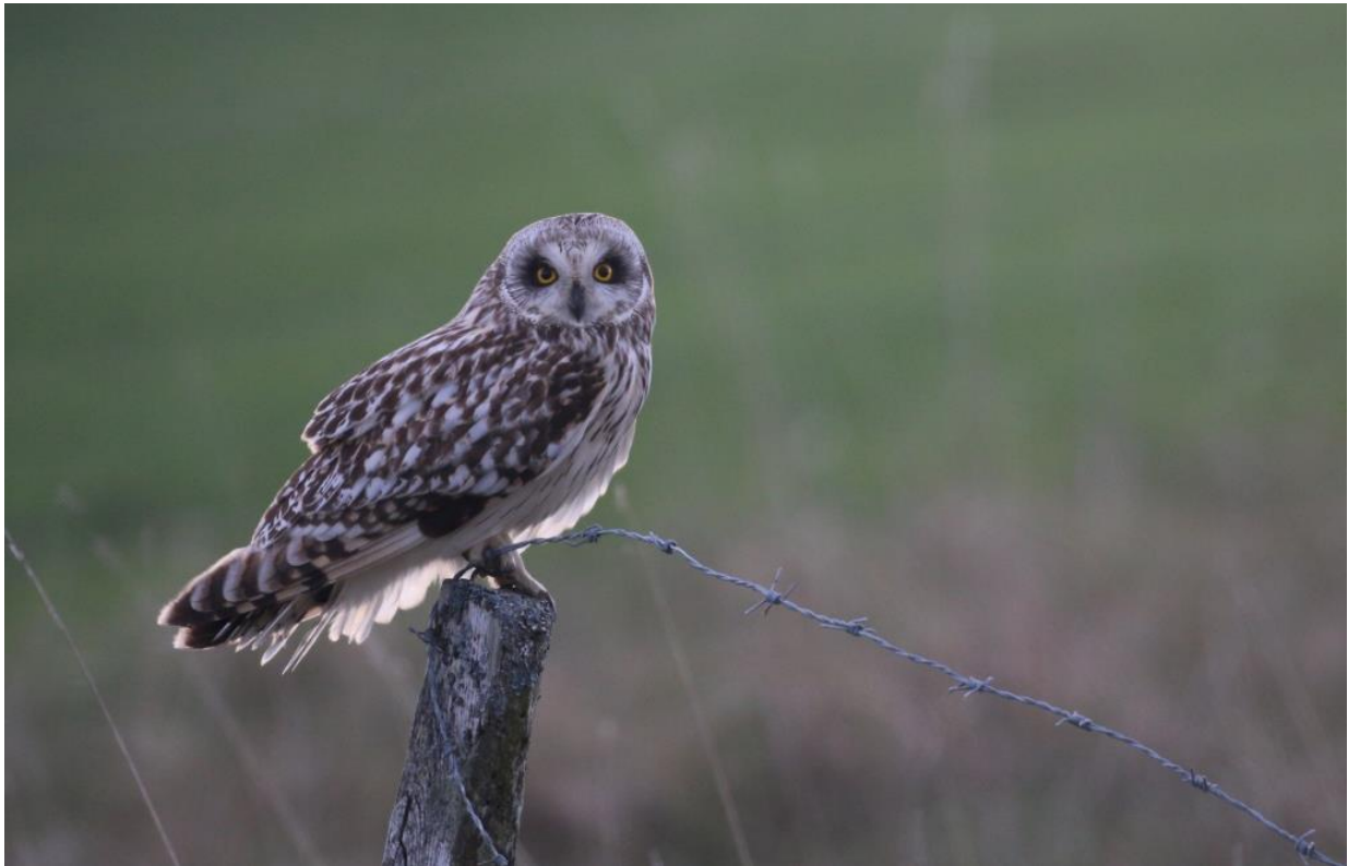
Short-eared Owl

Peatlands are important storage facilities for carbon; they also help regulate water storage and run-off, as well as providing water purification through filtration. The many tracks through Orkney's 'peat hills' offer access for hill-walking and bird-watching.