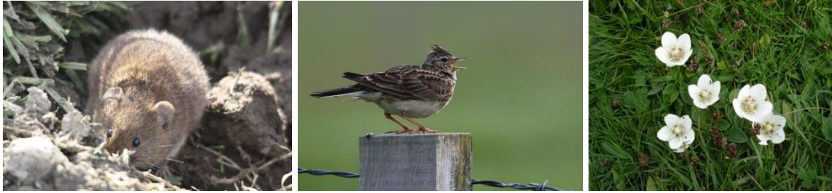
Orkney Vole, Skylark and Grass of Parnassus