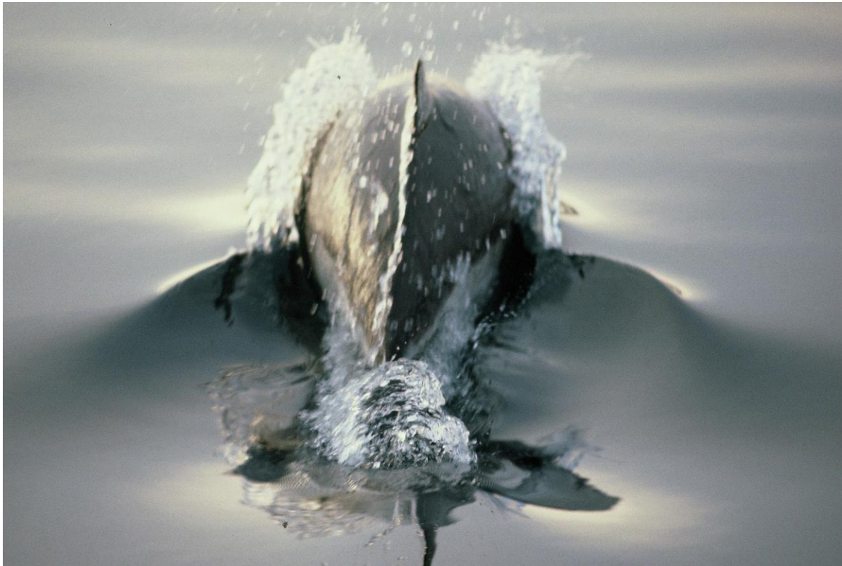
Harbour porpoise

The term biodiversity means, quite simply, all of life: all the species and genetic variations that exist on earth, from the tiny microscopic organisms that are invisible to the naked eye to the mighty whales that swim in our oceans. Together they form living systems, called ecosystems, which sustain nature and upon which our own survival depends.