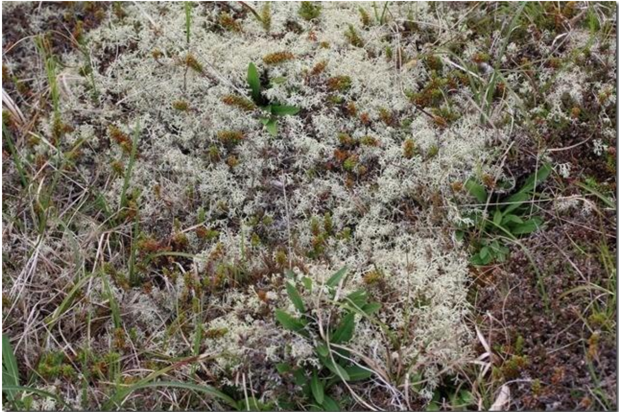
Lichen in heathland

bryophyte interest. Nitrogen deposition can increase the likelihood of insect defoliation of upland heathland.