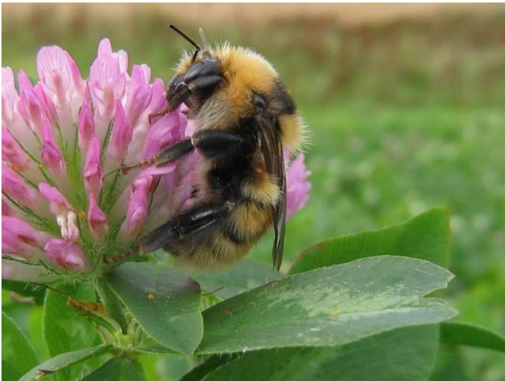
Great Yellow Bumblebee

Destruction of bees' and wasps' nests, whether deliberately or accidentally;