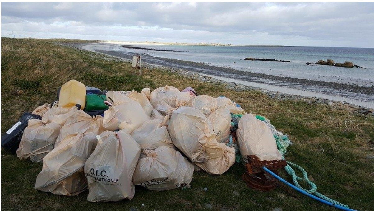
Bag the Bruck waste collected in Sanday

Bag the Bruck is a local clean-up initiative which takes place annually during April. Around 50 beaches and shorelines are targeted by over 1,000 volunteers and over a period of 9 days many tonnes of litter are collected, bagged and removed for disposal. Established in 1993 by Environmental Concern Orkney (ECO), Bag the Bruck is now administered by members of another local group, Outdoor Orkney. The Council lends its support by picking up and disposing of the waste that is collected.