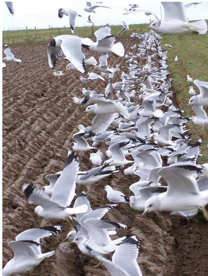
Gulls following the plough

The current SRDP will include at least one more round of AECS applications and five years funding will then be available, going forward. Following the United Kingdom's exit from the European Union, the long-term future of agricultural support payments remains uncertain.