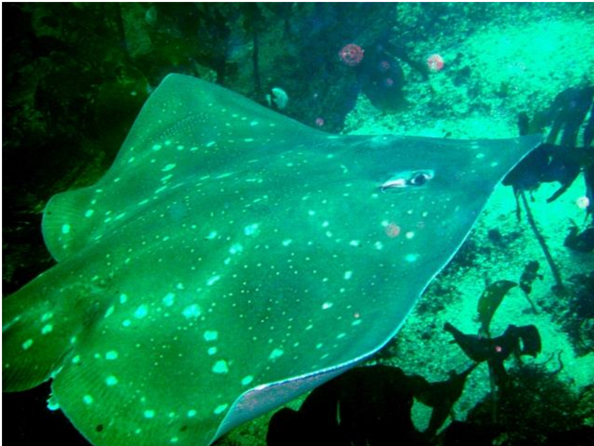
Flapper Skate

The Flapper skate is the largest skate in European waters and can grow up to 3m in length. It has a long, pointed snout and its upper side is brownish green with lighter spots (although not all specimens have these). There is a row of 12-18 thorns along the tail. Young skate have a black underside which fades to paler grey or cream as the fish ages. The pelvic fins in males are modified to create claspers for the transfer of sperm. Like sharks, the skate is an elasmobranch (a cartilaginous fish) and has no swim bladder; instead the fish maintains buoyancy with large livers, rich in oil.