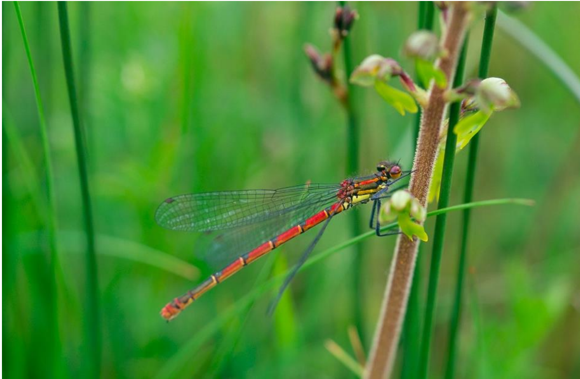
Large Red Damselfly

Keynote species: Hen harrier, Circus cyaneus ; Short-eared owl, Asio flammeus ; Golden plover, Pluvialis apricaria ; Red-throated diver, Gavia stellata , Large heath butterfly, Coenonympha tullia ; Heath carder bee, Bombus muscorum , Lichens; Sphagnum mosses; Orchids; Dragonflies and Damselflies.