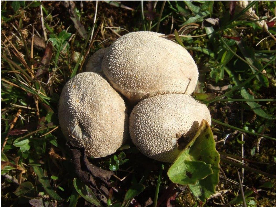
Puffballs

The Orkney Wildlife Information and Records Centre is based in the Orkney Library and Archive, on Kirkwall's Junction Road and provides vital support for biodiversity action planning. Established in 1998, the Centre provides a repository for the collection and dissemination of information relating to Orkney's natural heritage. Data on the County's habitats and species has been recorded over many years, both by voluntary recorders and by other organisations with an interest in the natural environment of Orkney.