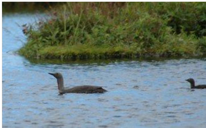
Red-throated Diver

Key features of Orkney's bog landscape are the many bog pools and lochans which provide nesting sites for Red-throated diver, Gavia stellata and also support a number of dragonfly and damselfly species.