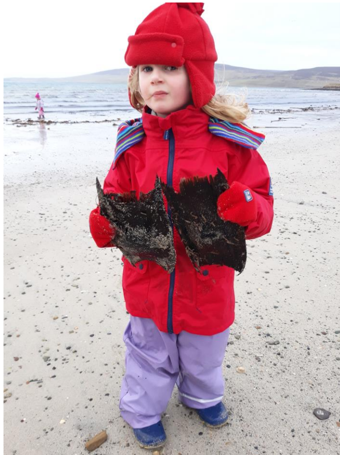
Egg Cases found in Evie