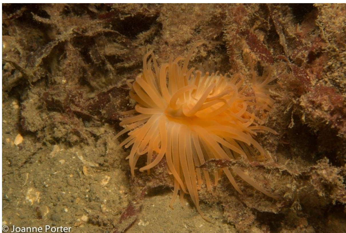
Flame Shell

Flame shells, Limaria hians , are bivalve molluscs with thin oval shells, usually about 2.5 cm in length but occasionally reaching 4 cm. The shell is white in young specimens, becoming whitish-brown with age and has a wavy margin. The edge of the fleshy mantle bears numerous conspicuous red and orange filamentous tentacles which resemble flames. Also known as gaping file shells, they live on the seabed inside nests which they build by weaving together tough threads (byssus) with surrounding materials such as seaweed, maerl, stones and shells. Adjoining nests coalesce to form larger structures containing multiple flame shells. These structures create a habitat that stabilises the sediment and provides an attachment surface for many other organisms including hydroids, bryozoans, ascidians, kelps and seaweeds, as well as scallop spat as it settles from the plankton. A rich diversity of fauna is also found within and below the flame shell bed. This diverse assemblage of organisms adds to the habitat's complexity and provides shelter and feeding grounds for species such as cod and saithe.