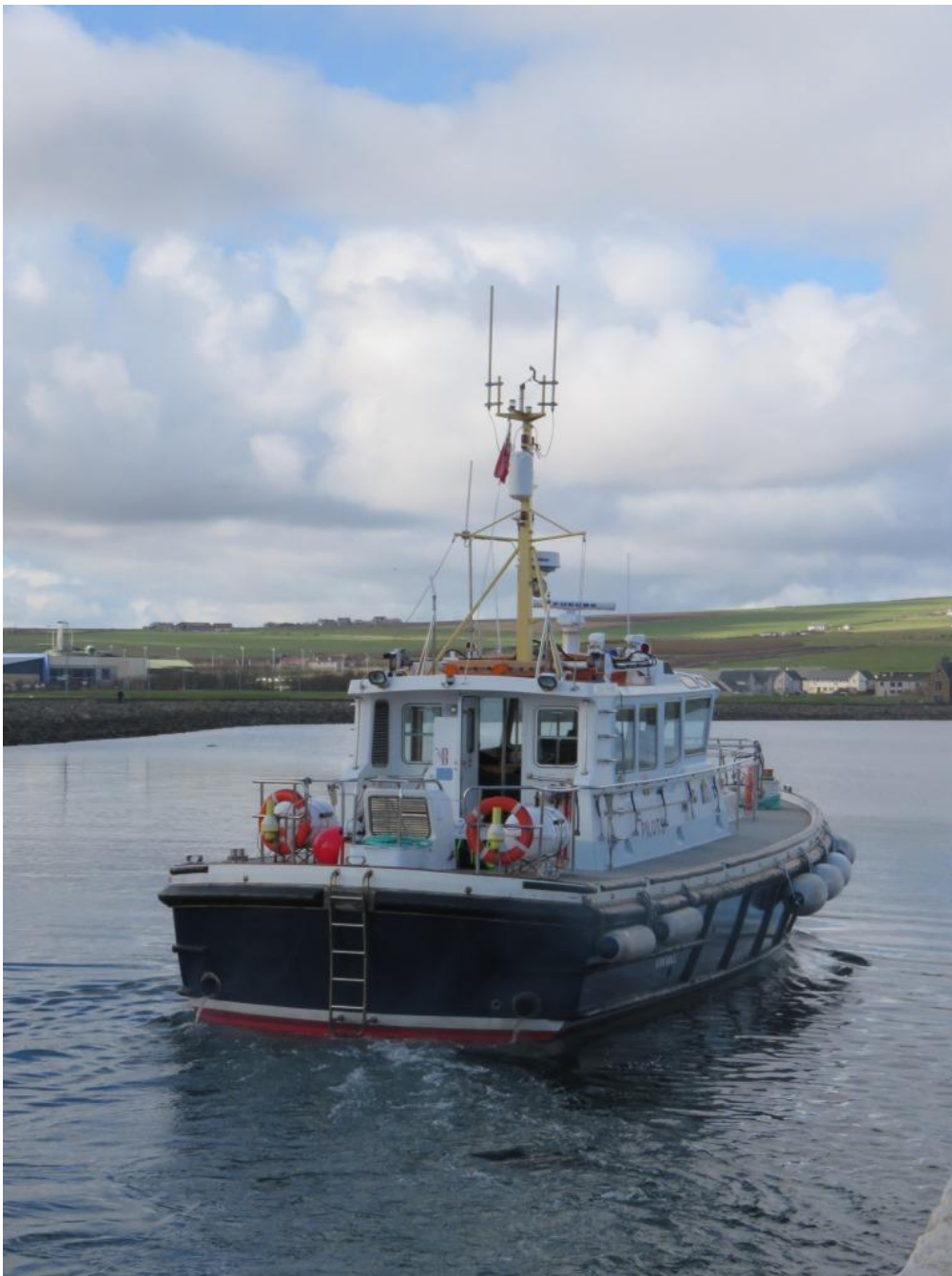
OIC Pilot Launch