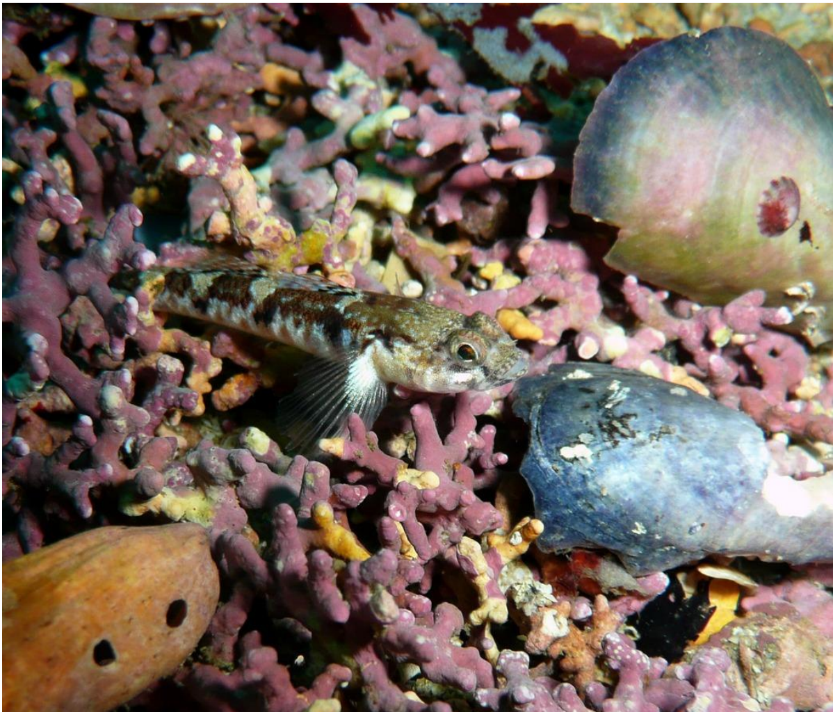
Goby on Maerl

Maerl is a collective term for several species of red seaweed, with hard, chalky skeletons. These form loose subtidal accumulations on the surface of soft sediments. In Orkney two species of red algae form maerl beds: Phymatolithon calcareum and Lithothamnion glaciale . Unlike most other seaweeds, maerl grows as unattached, rounded nodules or short, branched shapes on the seabed. However, in common with all seaweeds, maerl needs sunlight to grow; therefore, it typically occurs in shallow seas at depths of up to 30m. In favourable conditions maerl can form large and deep beds, i.e. in a fast, tidal flow or where wave action is sufficient to remove fine sediments, but not strong enough to break the brittle maerl branches. Within these beds, layers of dead maerl build up, topped by a thin layer of pink, living maerl.