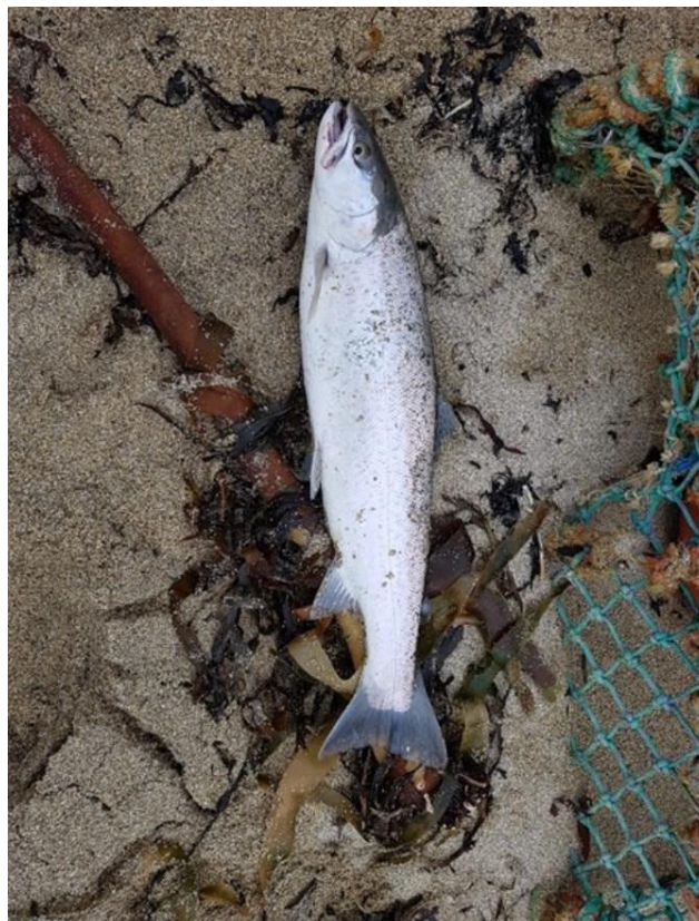
Sea Trout

The Sea trout, Salmo trutta , is an anadromous species, i.e. fish are born in freshwater, then migrate to the sea as juveniles where they grow into adults before migrating back to freshwater to spawn. It is the migratory form of the fresh water Brown trout. In the British Isles this species can grow up to about 1m in length and over 10kg in weight; however individual sizes vary widely between populations. As juvenile fish, they are characterised by the presence of red or orange spots on their flank, mostly above the lateral line. Those fish destined to become Sea trout change their colouration to silver as they prepare for downstream migration and during spring they enter the sea as silvery smolts. Some of these return to spawn in fresh water as mature adults between May and November of their first year at sea, whilst others return to overwinter in fresh water as juveniles, also known as 'finnock', and may not spawn at this time. These fish return to the sea, coming back to the burns to spawn in subsequent years. Spawning occurs in late autumn and many Sea trout will spawn several times during their lifetime. On their return to the rivers and burns they gradually darken to a reddish brown and male fish develop a hook or 'kype' on their lower jaws.