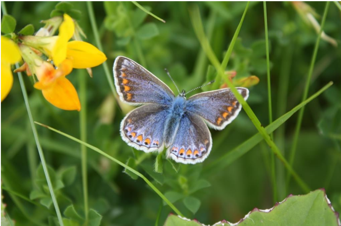
Common Blue Butterfly

Biodiversity is inexorably linked to sustainable development, and a rich biodiversity is generally associated with healthy environments. To ensure the survival of our habitats and species, and to pass down a healthy stock of natural assets for future generations, we must accept that we play a defining role in the sustainability and health of our islands. Therefore, we should all afford respect and protection to wildlife, along with the natural landscapes within which we live. It's important that we conserve the habitats and species that are rare or under threat, but equally we should appreciate the value of other, more commonplace biodiversity, and ensure its protection so that future generations can continue to benefit from it.