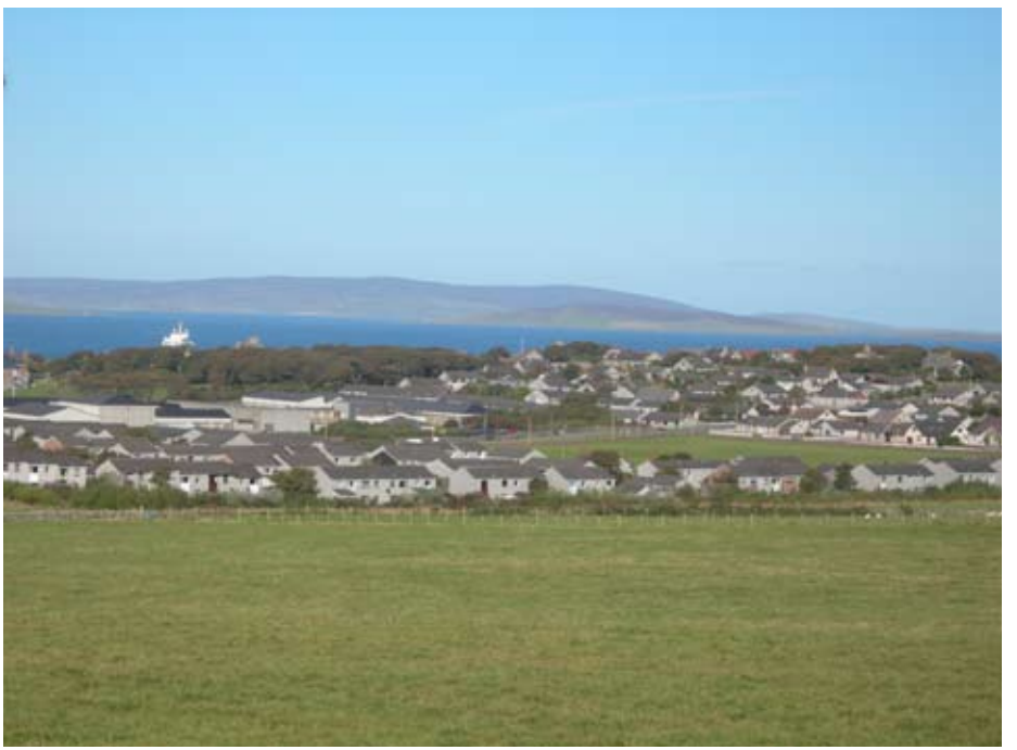
view looking north from the site

or fronting pedestrian routes or the public amenity space should not dominate the public areas. This will mean that as a general rule these boundaries should be less than 1m high stone dykes or timber fences