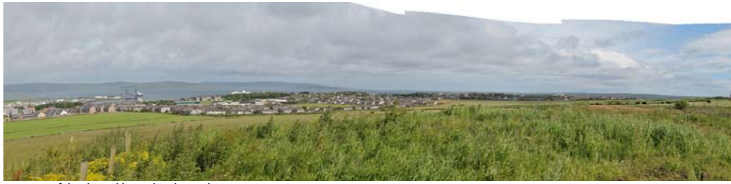
panorama of the site and beyond to the north