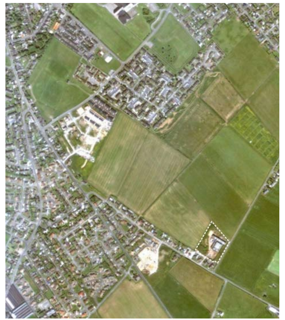
fig 2 the Black Building site in context

within 'Hierarchy 3' of public realm objectives by creating a community focus with a small civic space and home-zone principles