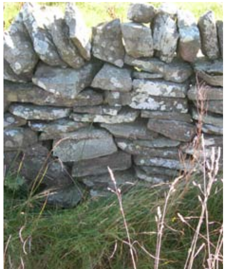
local boundary materials