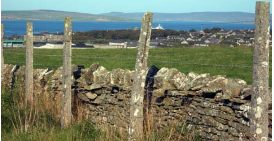
view from the site across Kirkwall

The southern edge of Kirkwall has been subject to sporadic and piecemeal