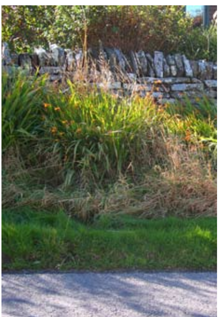
typical roadside verge detail close to the site

The initial phase of site infrastructure should provide the shared surface streets, site servicing (including Sustainable Urban Drainage Systems) and any offsite improvements to local transport and utilities which may be required in addition to the structured planting and boundary walls for the main pedestrian routes and site boundaries. Subsequent phases of development will be required to ensure that buildings are orientated to align with the building lines established in the development brief strategic plan, and to positively address the street frontages, pedestrian routes and areas