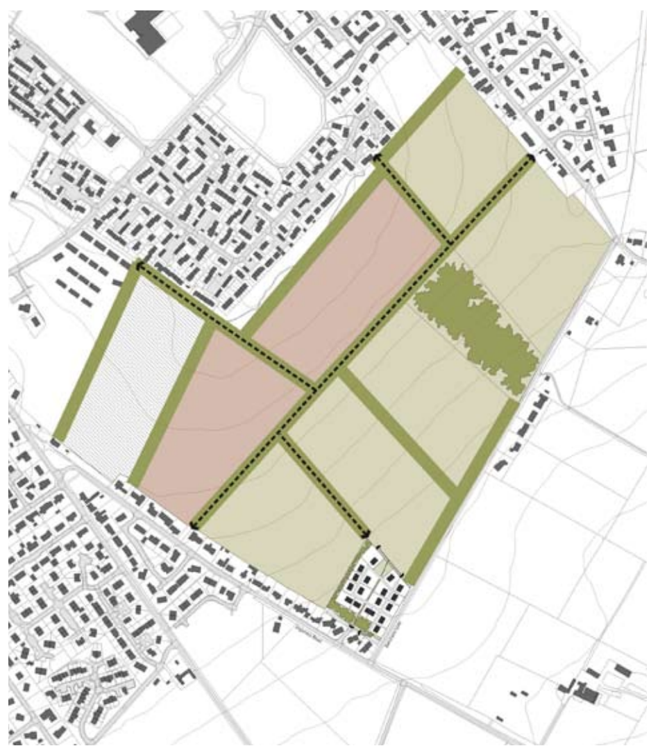
fig 5 future landscape and greenspace concept with shelterbelts and footpath links

requirements which could allow for larger or smaller plots than indicated. This could include detached, semidetached or terraced buildings.