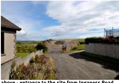
above - entrance to the site from Inganess Road below - looking at the site from Berstane Loan