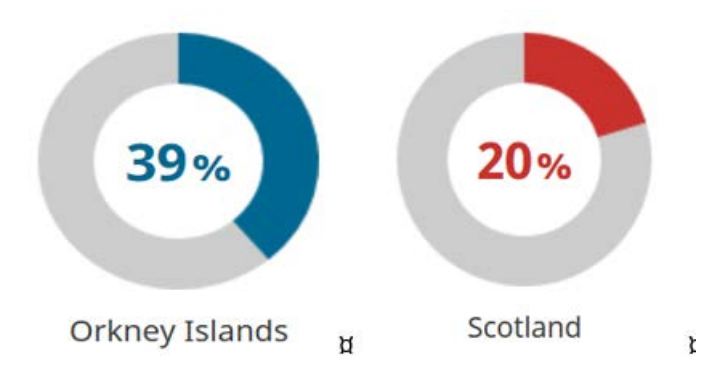
Figure 2: Percentage of Council Procurement spent on local small / medium enterprises – Scottish Local Authorities 2016 to 2017.