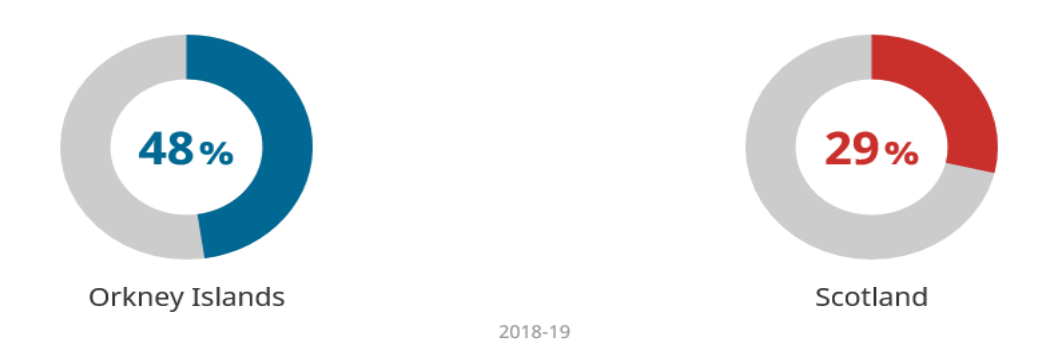
Figure 1: Percentage of Council Procurement spent on local SMEs 2018 to 2019.