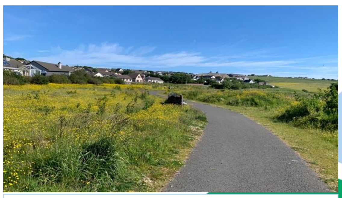
Arcadia Park is a community-designed green space and active travel network in Kirkwall.

Consider and promote shared mobility options, particularly in terms of active travel, access to bike hire or a bike scheme for Orkney (as per Policy 3).